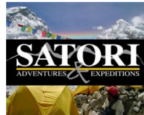
Satori Adventures and Expeditions

https://www.facebook.com/satoriexpeditions