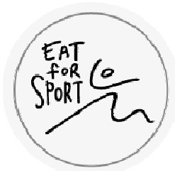
Eat for Sport