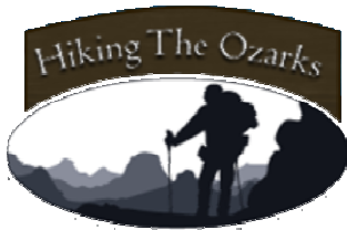
Hiking the Ozarks

https://www.facebook.com/satoriexpeditions