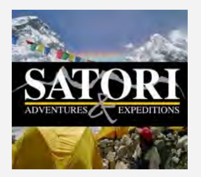
Satori Adventures and Expeditions facebook.com/satoriexpeditions