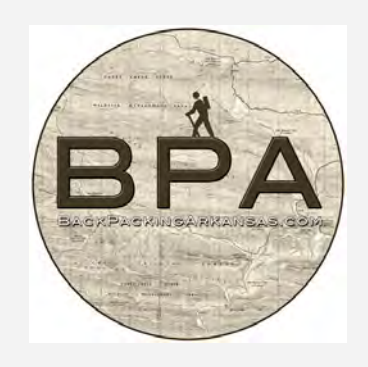
Backpacking Arkansas www.backpackingarkansas.com