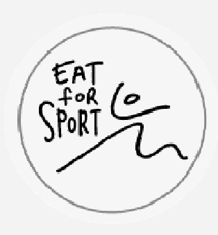
Eat for Sport www.eatforsport.com