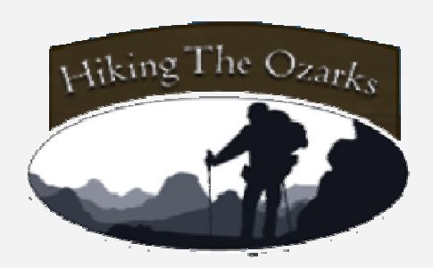
Hiking the Ozarks http://hikingtheozarks.com/