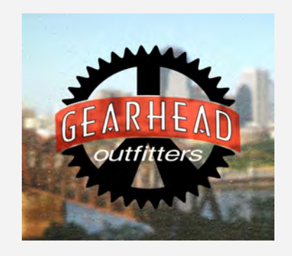
Gearhead Outfitters www.gearheadoutfitters.com