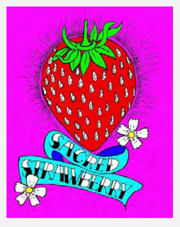
Sacred Strawberry <a href="http://sacredstrawberry.com">http://sacredstrawberry.com</a>