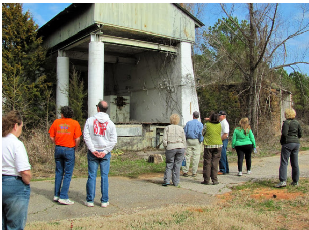
Viewing a concrete structure on the refuge.

They serve as the refuge 'hosts' and Todd has built several structures on the grounds. Susan is the official inspector of the 67 bluebird houses that are placed all around in the 8,500 acre refuge.