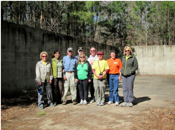
The group, in a bunker