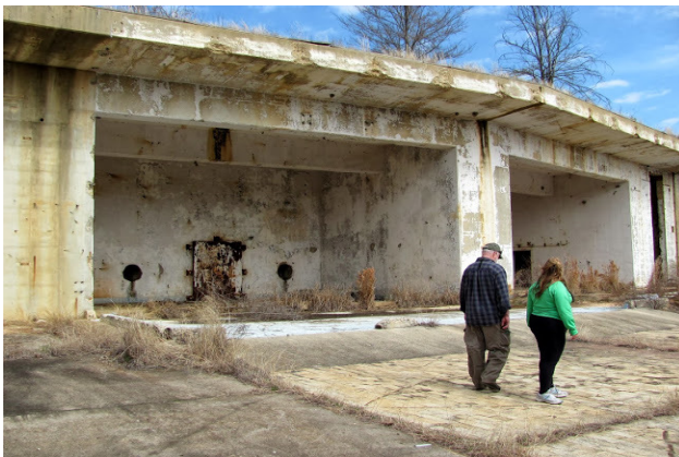
Dick and Toni on a site where rockets were tested.

I hope all BCOS members will take some time to visit this refuge. It encompasses one of the few virgin old growth bottomland hardwood forests in Texas. It includes habitat for waterfowl as well as for a diverse community of plants and other animal species. It is included as part of a Ramsar Site - a ‘wetland of international importance’. The best part is - it’s only about 35 min from Shreveport! Go there!